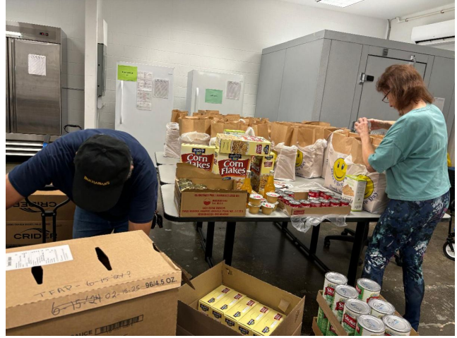
Photos of volunteers amid packaging and dispatch activities from the North Haven warehouse (above and below).